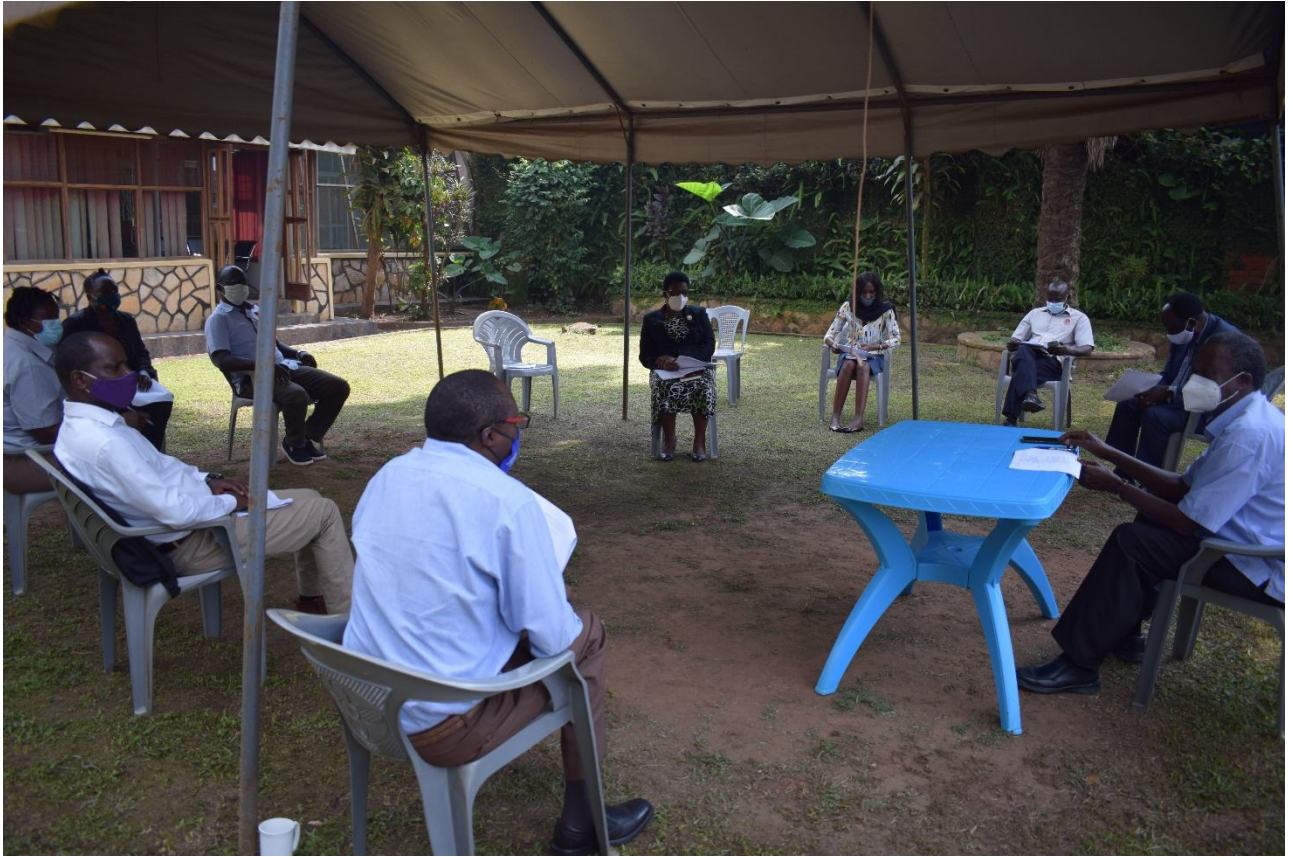
Figure 2 ACHEST staff members observe social distancing during the meetings