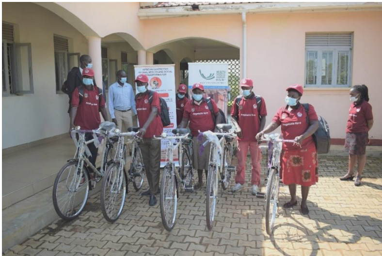
Figure 4 Village Health Teams in Ngora District receiving bicycles and other tools that they need as they move from household to household to register the health status of each individual. This is under the Intersectoral Collaboration for Health project

the communities, social cohesion and utilization of public health services. (Details: https://africa-health.com/wp-content/uploads/2021/02/AH-2021-01-11-ISC.pdf )