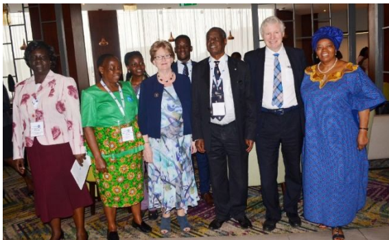
Figure 6 Nursing Now Global Board at the Regional Meeting in Kampala