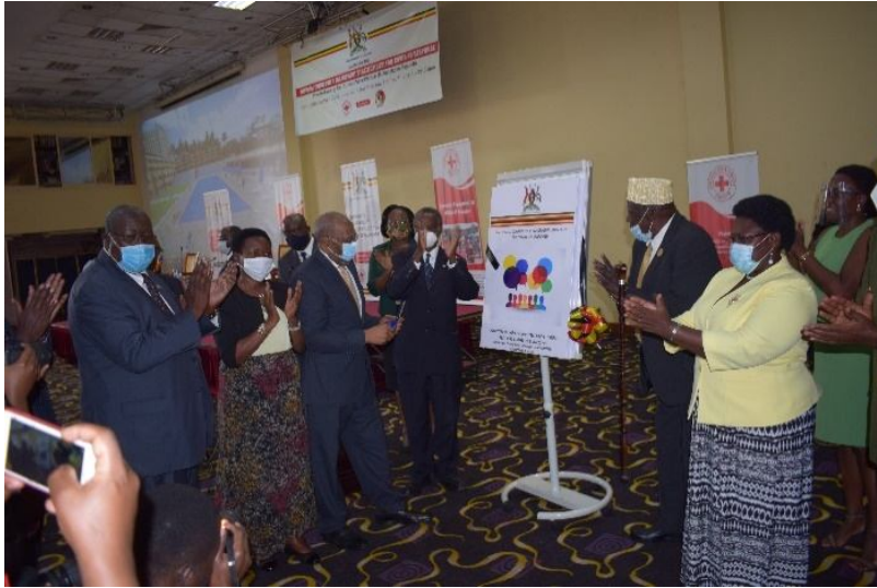
Figure 5 Prime Minister Dr. Ruhakana Ruganda officially launched the Community Engagement Strategy in October 2020