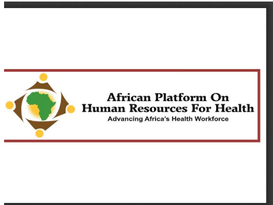
Figure 9 Logo of the African Platform for HRH

ACHEST is the secretariat of the African Platform for Human Resources for Health ( aphrh.com ).