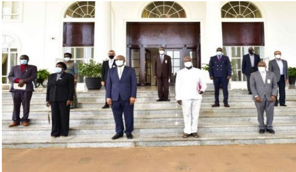
Figure 3 COVID-Fund committee with President Museveni at State House Entebbe