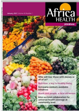
Figure 11 Africa Health Journal Cover page