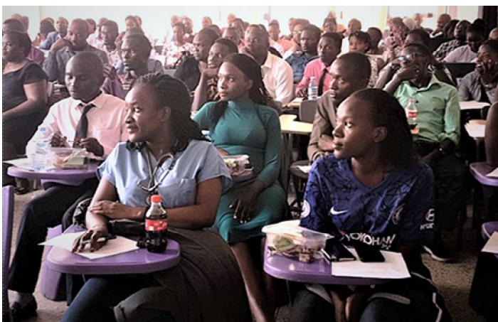
Figure 10 A section of medical interns that attended the March 2020 session before COVID19 was reported in Uganda. The programme is now hosted virtually

The ACHEST Medical Interns induction programme held two sessions in March and July 2020.