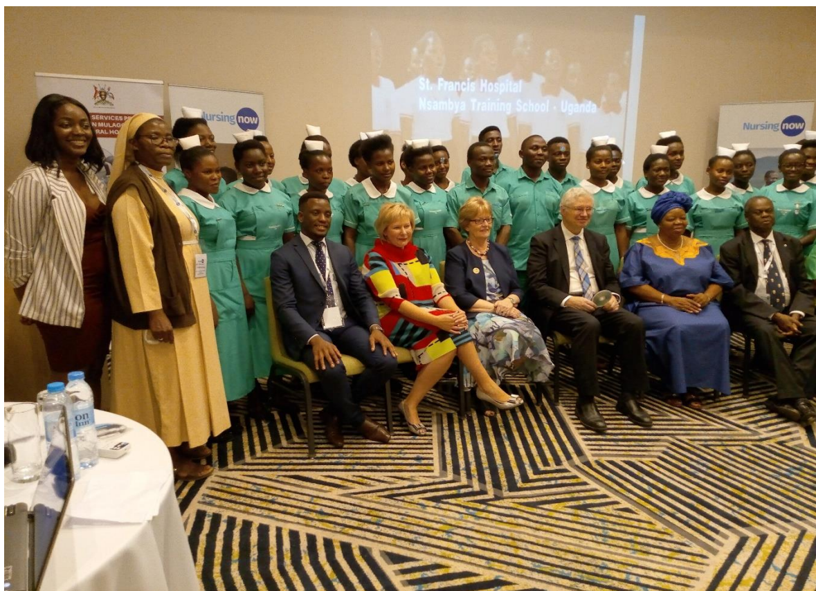
Figure 8: Nursing now Global Board meeting at Hilton Garden Inn Kampala, Uganda

Scholarships for young nurses on leadership has been established and some Ugandan nurses have benefitted.