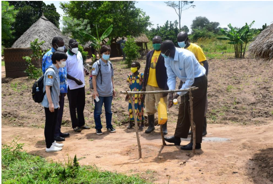
Figure 2: Homemade Tippy Tap at Entrance of Households

ACHEST continued to provide national leadership in the Community Engagement Subcommittee of the National Taskforce for COVID-19 Response. Weekly meetings take place virtually and well attended by GoU and Partners providing guidance to District and Sub-district structures in the fight against COVID-19. Special support was provided to the four Pilot Districts of Amuru, Busia, Mukono and Ngora with a grant from JICA where the CES was implemented to scale. Village Health Teams were provided training, equipment and supervision; including activation of Village Covid Taskforces to promote Community Dialogue and social cohesion. As a result, there was a marked improvement in all monitored health indicators and household hygiene and sanitation. These results will be shared with policy makers in and outside Uganda.