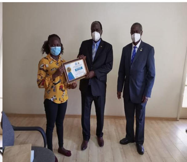
Figure 7: ACHEST receives a certificate from the Federation for Uganda medical interns