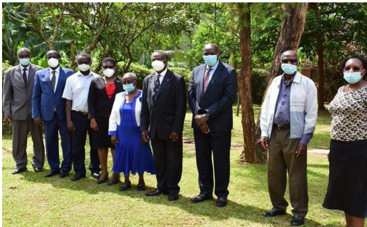
Figure 1: ACHEST Board of Directors take a group photo after a meeting on November 25, 2021

Governance arrangements were reviewed with the creation of a Consulting department and a new organogram. The number of staff on the regular payroll was reduced and the emoluments were also adjusted down to respond to available resources. Governing Board meeting all took place on schedule.