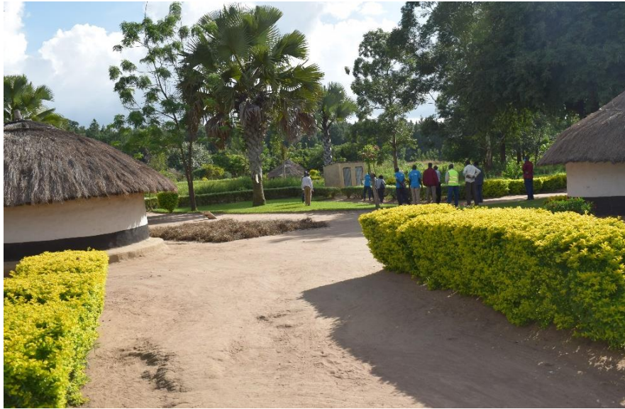
Figure 3: A model Home in Amuru district